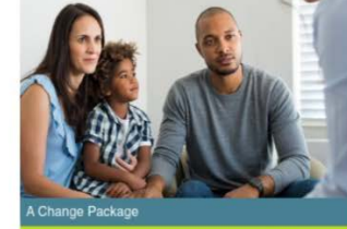
A Change Package

Supporting Resilience, Emotional, and Mental Health of Pediatric Patients with Chronic Conditions and Their Families